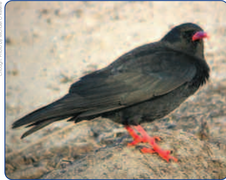
Chough

Birdwatching is a growing activity on the Dingle Peninsula. Many serious birders travel to Dingle to watch the thousands of seabirds, waders and duck, to find rare waders and wildfowl blown across the Atlantic in autumn, or to find rare gulls in winter.