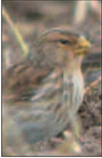
The Twite has become increasingly rare in the area.